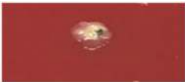
Fig. 4: Molar Tooth Appearance of Colony on Anaerobic Blood Agar