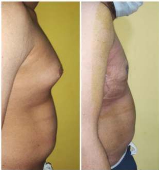
Figure 1: Lateral view (a) Pre-operative, (b) Post-operative

Liposuction was performed with standard Coleman technique. Gland excision was done with right inferior areolar semilunar incision. Post-operative period was uneventful and the patient was discharged the next day under satisfactory conditions (Figs. 1-3).