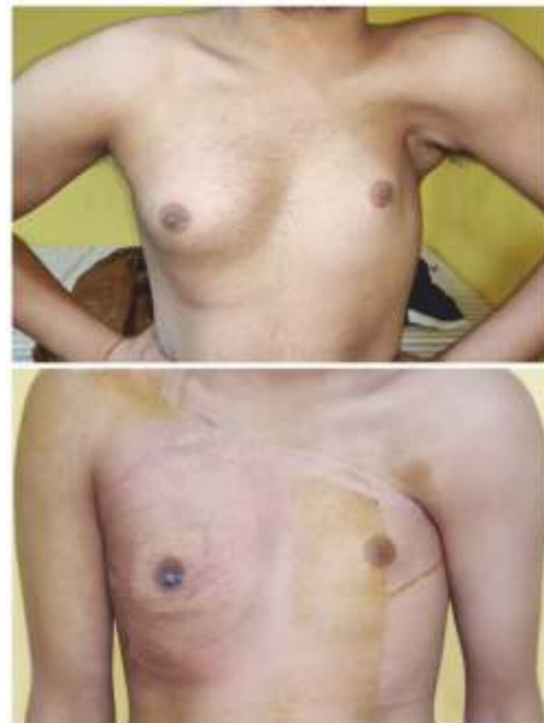
Figure 2: Front view (above) Pre-operative, Post-operative (below)