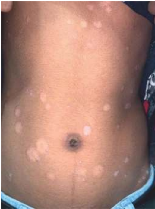
Fig. 7: Chronic Plaque Psoriasis

impetigo consistent with the findings of Javed et al. [9]. Out of the fungal infections, Pityriasis versicolor was most commonly seen in our study alike the findings of Reddy V [10]. Scabies was the predominant finding under parasitic infections which was similar to a study conducted by Balai et al. [6]. Molluscum contagiosum was the prominent finding, followed by viral exanthema under viral infections as in study by Kacar et al. [11]. Among the eczematous group of diseases, atopic eczema was most commonly seen followed by seborrheic dermatitis simulating the results of study conducted by Saini et al. [8]. Chronic plaque psoriasis (Fig. 7) was the prominent finding under the papulo-squamous group of diseases consistent with the findings of Mostafa et al. [12]. Under the keratinisation disorders, lamellar ichthyosis and keratosis pilaris were commonly seen with three cases of each. Acne vulgaris was the most