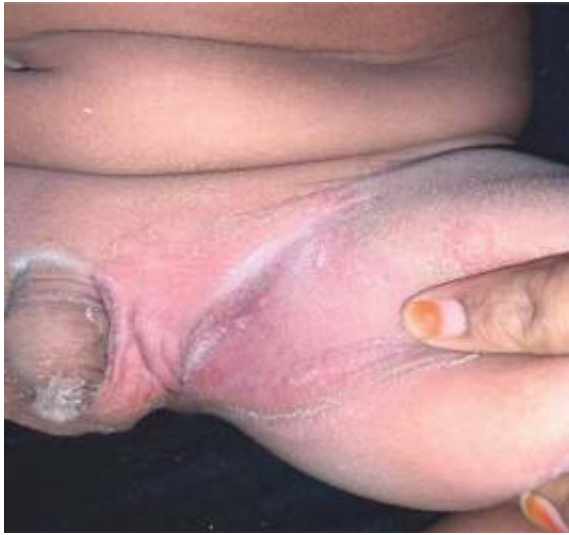
Fig. 1: Diaper Dermatitis