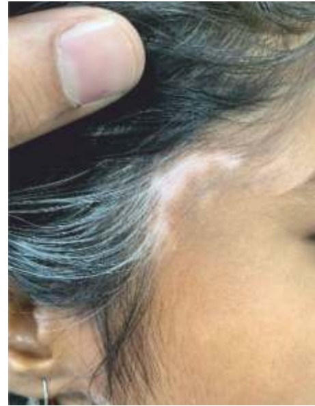
Fig. 6: Vitiligo

The eczematous group of disorders predominated the non-infectious diseases category (Fig. 4) with atopic eczema (99, 17.84%) being the commonest. Phrynoderma (11, 1.98%) was the most common nutritional disease followed by angular cheilitis (9, 1.62%). Alopecia areata was the most common finding under the hair specific dermatoses whereas leuconychia was the commonest nail finding. Papularurticaria (Fig. 5) (34, 6.13%) followed by contact dermatitis (24, 4.32%) was the most common finding under hypersensitivity dermatoses. Under pigmentary dermatoses, vitiligo (Fig. 6) was the commonest finding (20, 3.6%) followed by melasma (9, 1.62%); Becker nevus (5, 0.9%) being the most common finding under nevoid and developmental disease. Keloid (7, 1.26%) was the most common under miscellaneous disease followed by xerosis (4, 0.72%). Pyogenic granuloma was the most common disorder under vascular malformation disorder; morphea being the commonest under connective tissue disease with four subjects present in each.