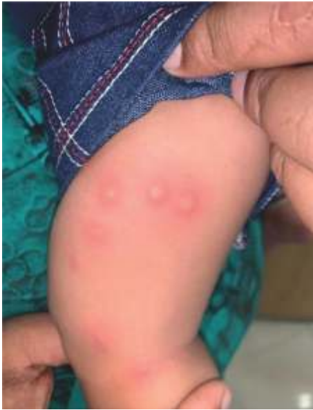
Fig. 5: Papular Urticaria