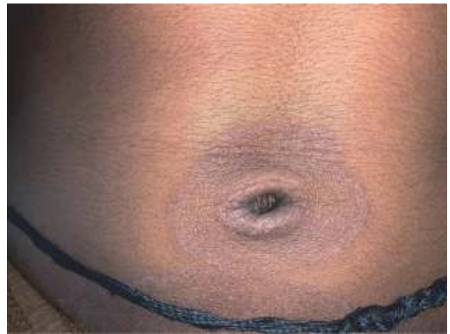
Fig. 3: Tinea Incognito