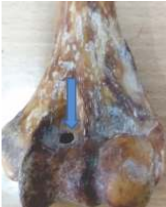
Fig. 2: Supratrochlear Foramen having Rectangular Shape