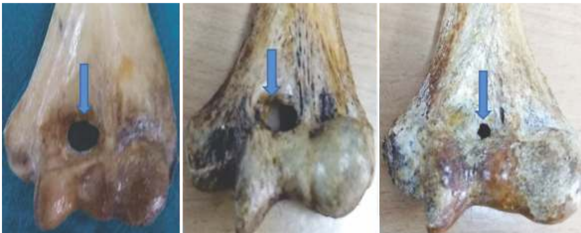
Fig. 1a, b, c: Supratrochlear Foramen having Irregular Shape