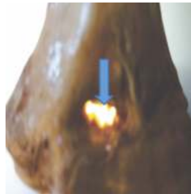
Fig. 6: Humerus showing Translucency of Septum between Olecranon and Coronoid Fossa