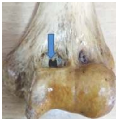
Fig. 3: Supratrochlear Foramen having Hourglass like Shape