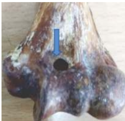
Fig. 4: Supratrochlear Foramen having Triangular Shape