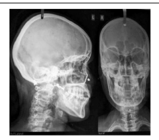
Fig. 1: X-ray Skull AP/Lateral: Well Defined Small Rounded Punched Out Radiolucent Areas Noted Diffusely Involving the Calvarium

Immunofixation electrophoresis revealed the presence of biclonalgammopathy (IgA kappa and IgM kappa).