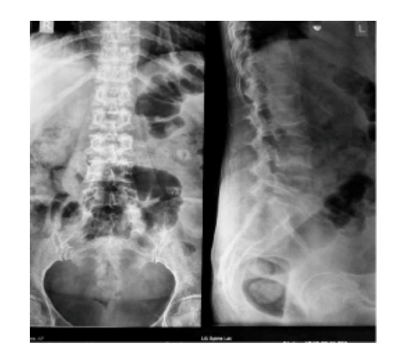
Fig. 2: X- ray Lumbosacral Spine AP/Lateral: Osteophyticlippings Noted in L3, L4 and L5 Vertebral Bodies

Fig. 1: X-ray Skull AP/Lateral: Well Defined Small Rounded Punched Out Radiolucent Areas Noted Diffusely Involving the Calvarium