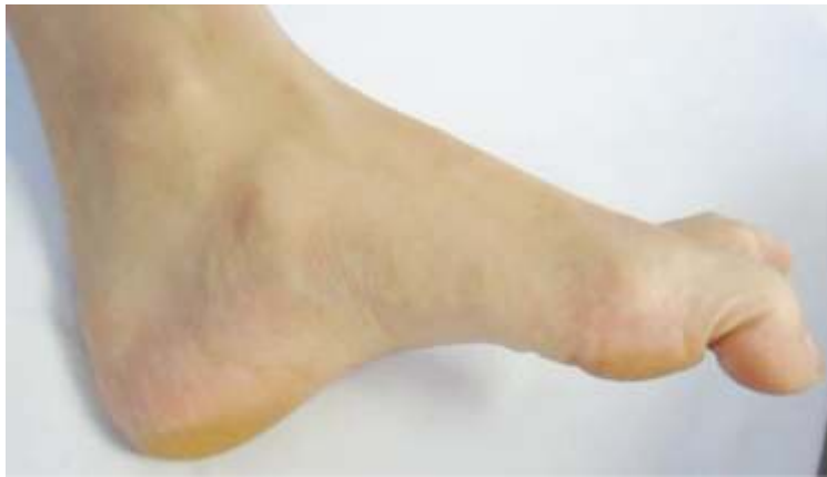
Fig. 1: Flexion Attitude of the Big Toe

was put on a posterior slab for 6 weeks. Rehabilitation process started after 6 weeks, with gradual range of motion and muscle strengthening exercise. She was allowed to resume her ballet dancing after 3 months. On final follow up she was able to resume the position of 'enpointe' with no more triggering of the big toe and pain free (Fig. 3).