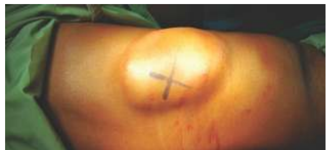
Fig. 1: Swelling over Back

of similar lesions over the breast, genitalia or any other site. There was no history of trauma or pathologic lesions. No history of fever or loss of weight or appetite was present. On examination, there was single oval, smooth, well defined edge, non fluctuating, non trans-illuminant, nonpulsatile, irreducible, mobile, tender swelling with variegated consistency on the back near right scapular region measuring 8x5 cm (Fig. 1). There were no signs of inflammation. Blood Tests revealed serum calcium of 9.39 mg/dL (8.9-10.3), serum phosphorus of 3.41 mg/dL (2.5-4.5), urinary calcium of 1.18mg/dL and normal parathyroid assay. X-ray (Fig. 2) and Ultrasonography of swelling demonstrated calcinosis. FNAC revealed the accumulation of calcium salts in the dermis. The swelling was excised in toto (Fig. 3) and histopathology report revealed tissue comprising of fibrocollagenous tissue admixed with mature adipocytes, congested blood vessels and large area of calcification features consistent with CC (Fig. 4). The patient was administered antibiotics for 10 days and advised periodic follow up.