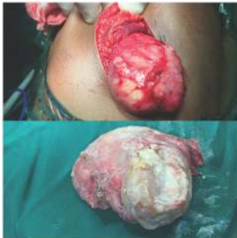
Fig. 3: Excised Specimen