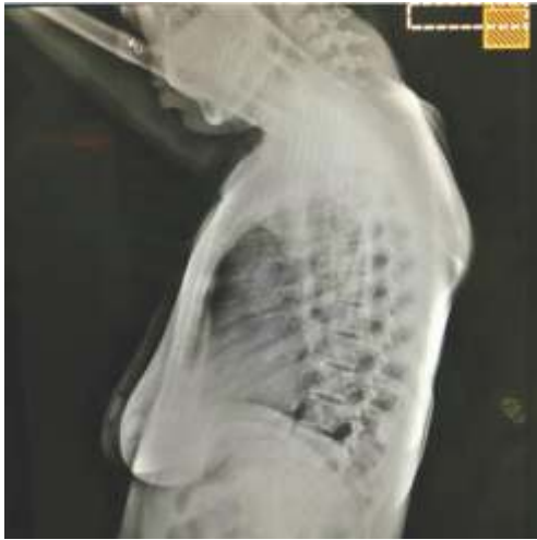
Fig. 2: X-Ray showing Calcified Nodules over Scapular Region