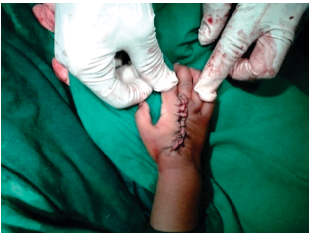
Fig.3: Excess Skin was Excised and Sutured