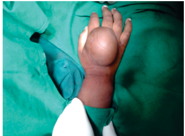
Fig.1: Clinical Photograph of Swelling

Histopathological examination of swelling revealed Mixed Hemangio-lymphangioma with infiltration into skeletal muscles.